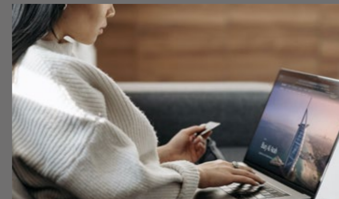
Pay with Points