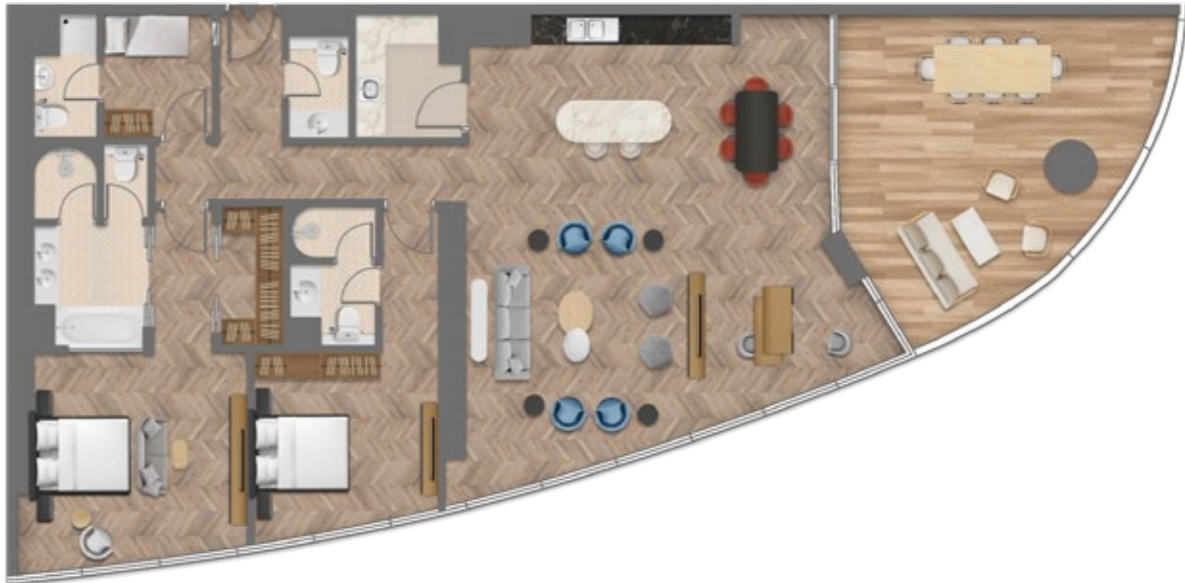
2 BEDROOM APARTMENT, TYPE B