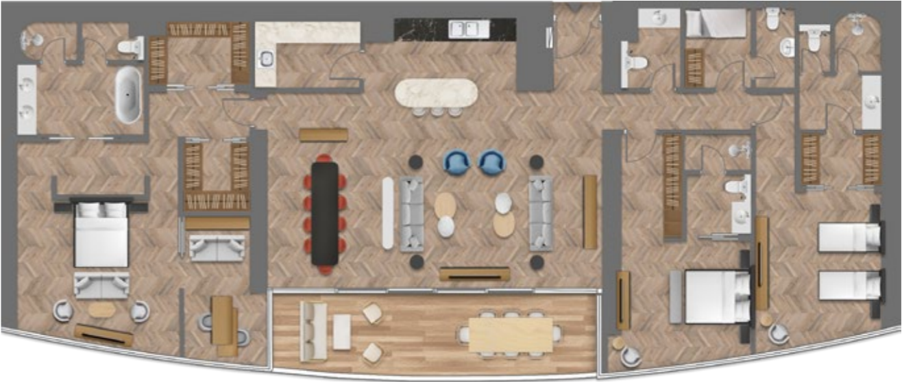
3 BEDROOM APARTMENT, TYPE C